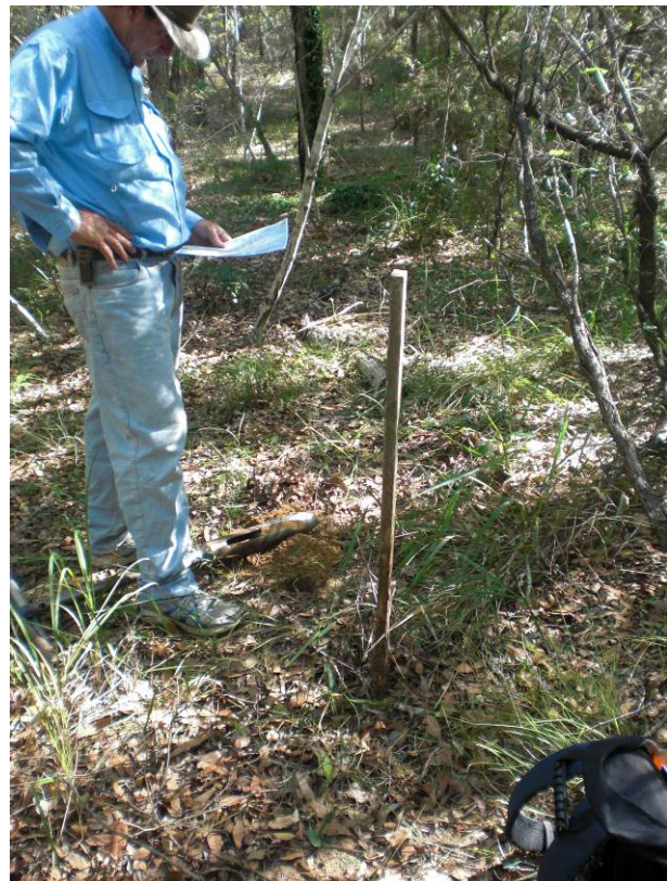
Hand auger hole SS3 - Middle Island. Note survey stake from previous drill lines.

Traverses were made of the deposits at both Middle and Hummock Hill Island correlating the GIS data with existing drill lines observable on the ground. Stakes delineating drill lines created by RZM Limited (now Bemax Resources) in the early 1990s were discernable in some instances and hand auger locations were arbitrarily located in order to confirm the presence of heavy mineral (HM) sands. Generally the HM 'strands' were readily identifiable, however in several locations they are likely to exist at a greater depth than that achievable with a hand auger. Soil samples were collected at various depth intervals down the hand auger holes.