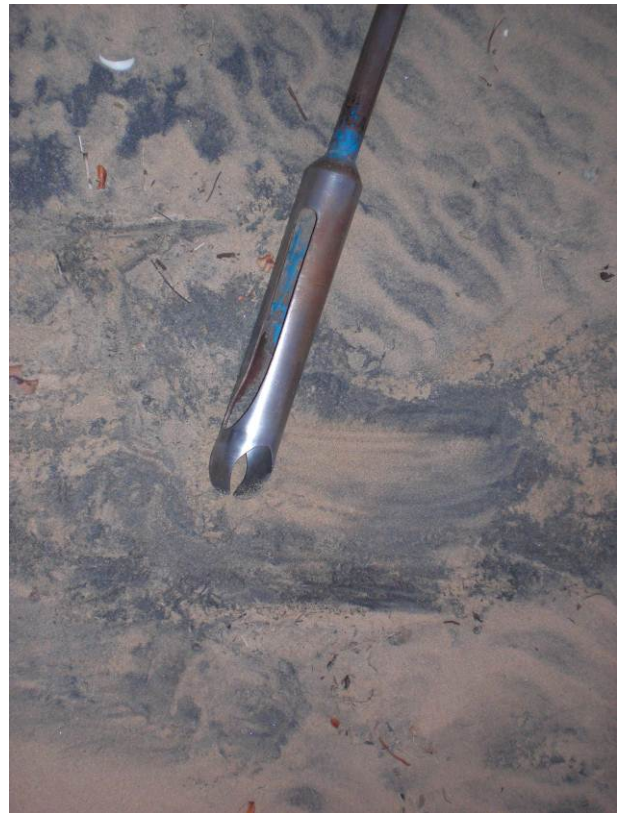
HM evident in beach sands on the south eastern tip of Middle Island. Note auger head is 500mm in length.

Soil sample SS5 – 0.3m has a relatively low ilmenite product and zircon content and contains a large component of trash minerals.